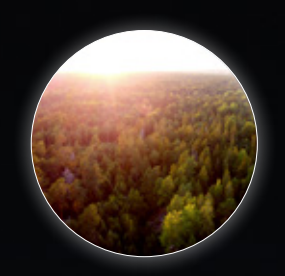
Eco Dry + technology Fast cycles and energy saving

Lara XL will exceed your expectations. The device convinces with even more capacity, energy-saving and fast type B cycles. Its connectivity and advanced traceability options make the sterilizer ready for all individual needs now or in the future. Moreover, the easy navigation guarantees complete control of the workflow, saves time and offers full protection for you and your patients.