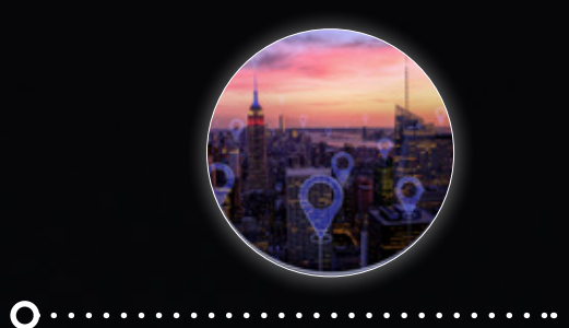
Advanced traceability Set a new standard with EliTrace